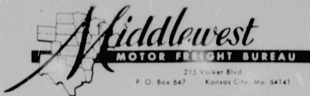
Exhibit A (Three pages)